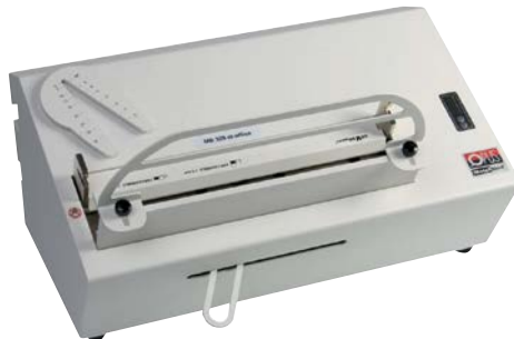
OPUS MB 300 -el office

Documents bound and embossed by using OPUS Metalbind & Goldcover machines.