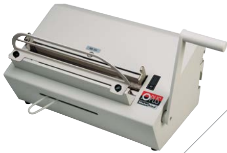
OPUS MB 300