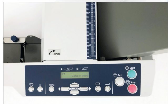
Easy to use interface.

The capacity of the automatic feeding station is up to 500 sheets. A job counter indicates the number of processed sheets. Equipped with a digital pre-counter (count-down-function) with interval mode, this allows the machine to have short break after a fixed number of sheets are folded, this enables the operator to remove a fixed number of documents without stopping the machine.