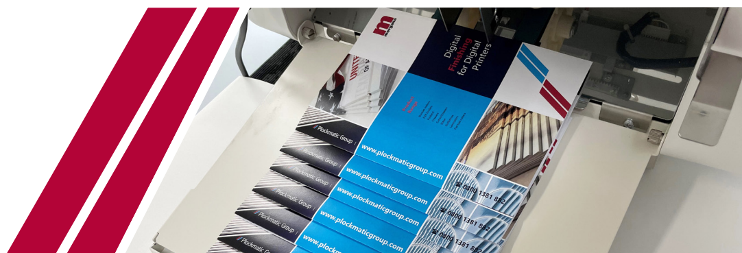
Junior DT-A Folder | Junior DT-M Folder