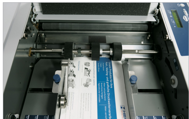
Fine adjustment on crease or parallel fold.