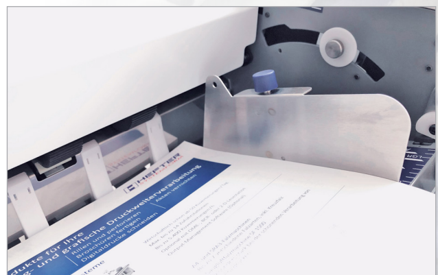
500 sheet feeding tray with the ability to count and pause job.