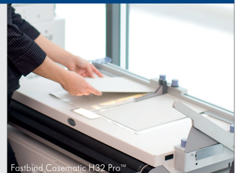
Fastbind Casematic H32 Pro™

Once the cover is made, you can finish the book using a Fastbind Binding machine. Fastbind provides all the necessary materials and supplies to produce hard covers for the print-on-demand environment.