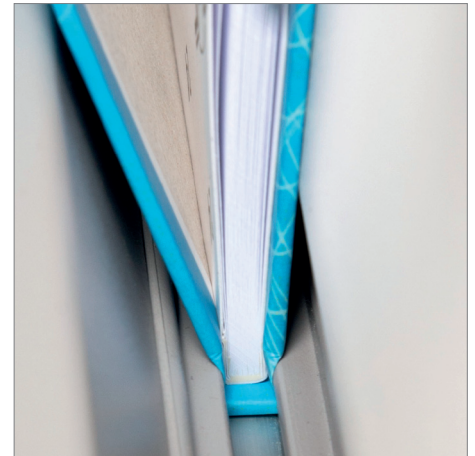
Hot knife groove pressing from two sides simultaneously

The hot plate inside Pressomatic™ is situated deep inside the machine, keeping it safely away from the operator. And with its compact design, the Pressomatic™ fits easily onto most any table top.