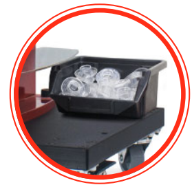
Trays for eyelet & washer storage