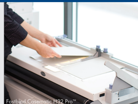
Fastbind Casematic H32 Pro™

Once the cover is made, you can finish the book using a Fastbind Binding machine. Fastbind provides all the necessary materials and supplies to produce hard covers for the print-on-demand environment.