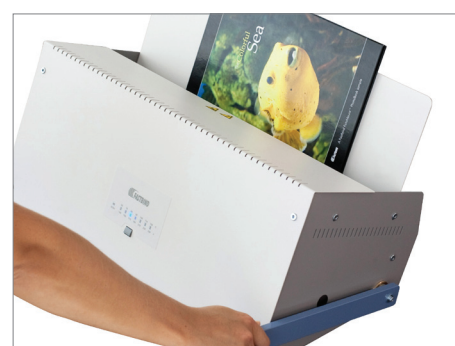
Easy to use.