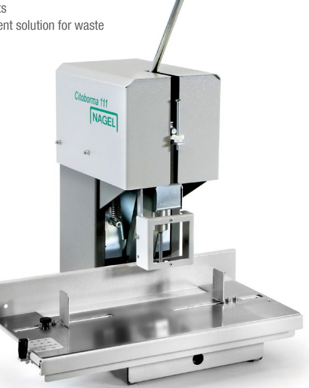
NAGFI -Citoborma 111