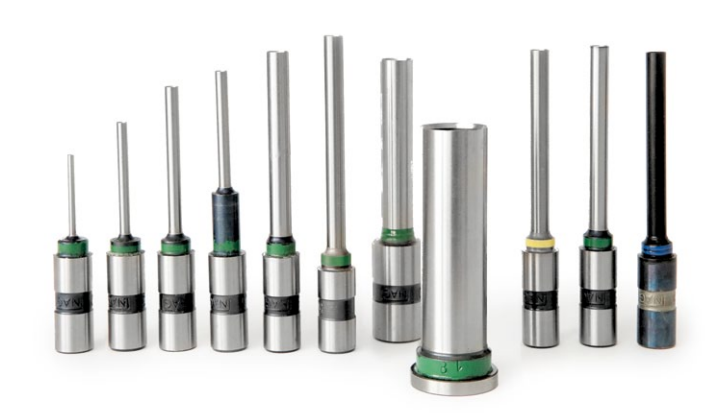
Nagel paper drill bits: 2 - 35 mm diameter, 30 - 60 mm working length, and special designs on request