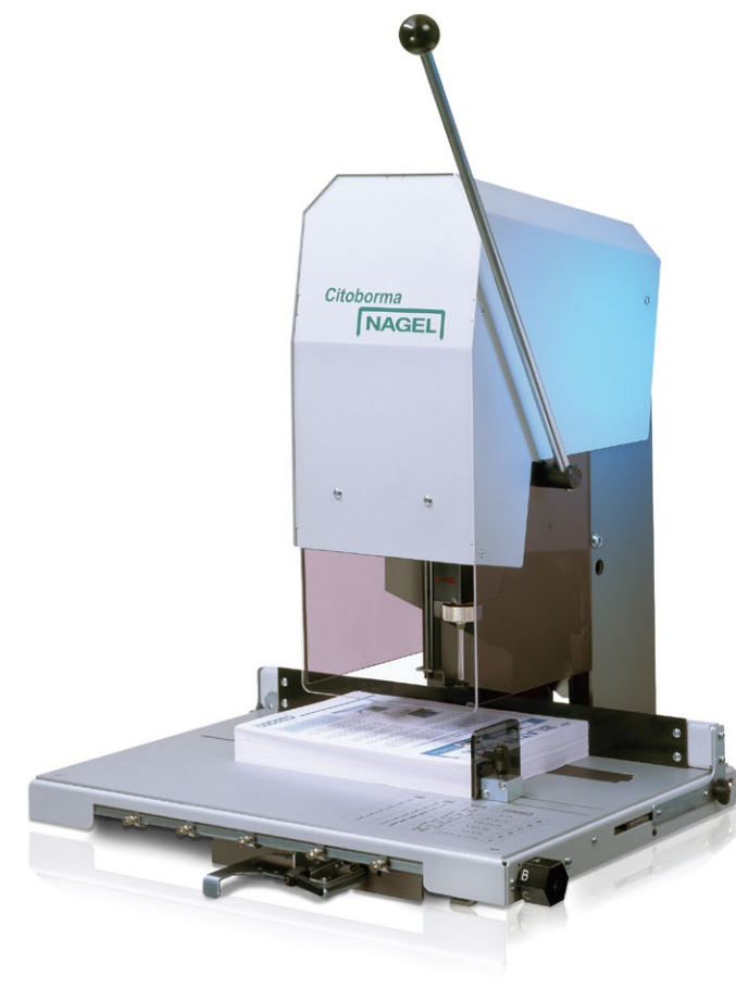
NAGEL-Citoborma 190 table top

The FlexoDrill° sliding table releases automatically after each stroke. It can be fixed at any position if required and the individually programmed tabulator bars are interchangeable. These remarkable features are suitable for multi-purpose applications.