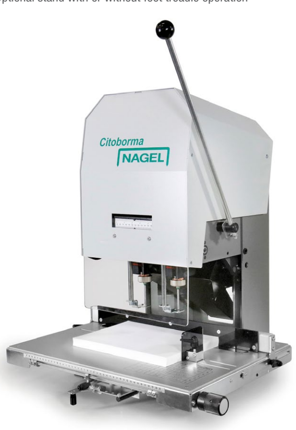
NAGEL-Citoborma 290 B table top