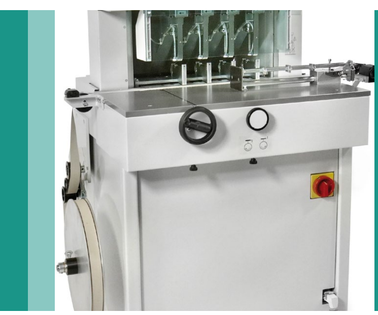
Manual indexing drill matrix ( cardboard )