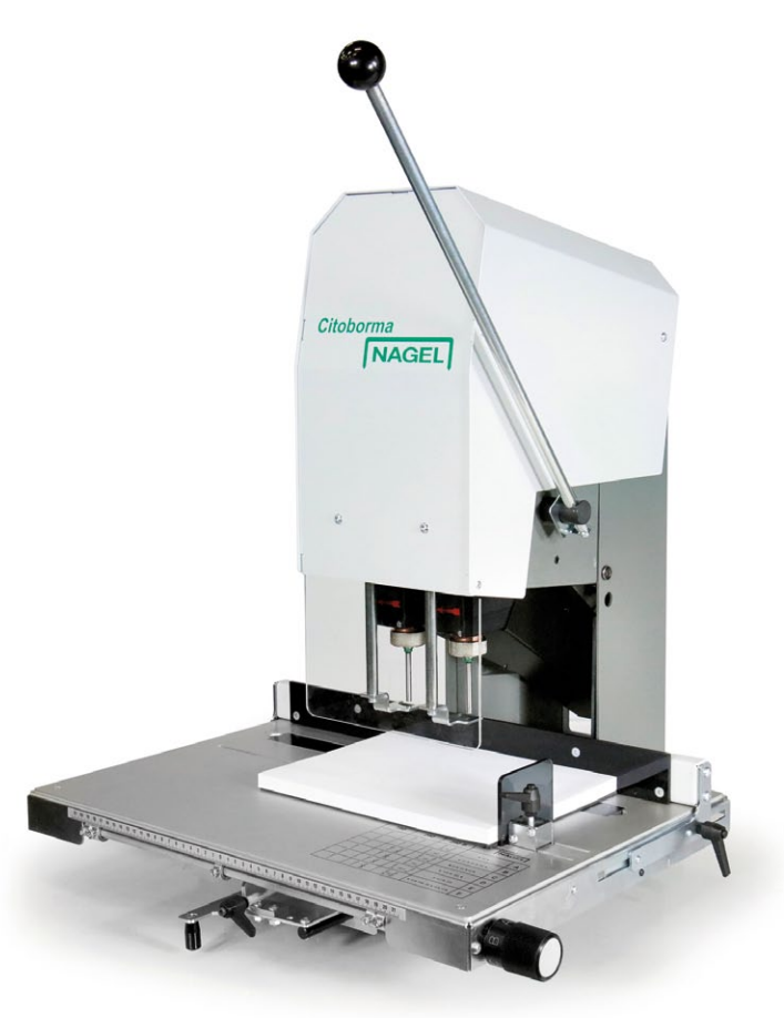
NAGEL-Citoborma 290 table top