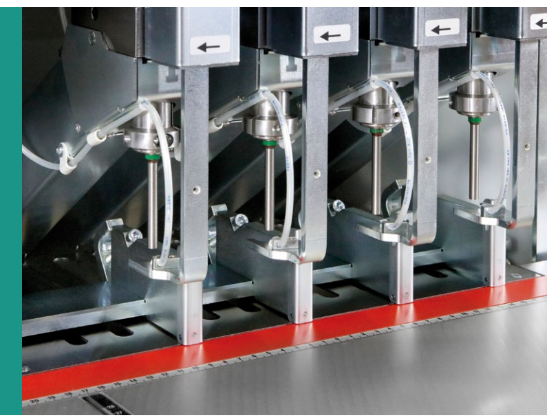
Professional drill bit lubrication with cooling system

By using the manual indexing drill matrix even the lowermost sheet is drilled precisely and at the same time the wear on the drill block is prevented.