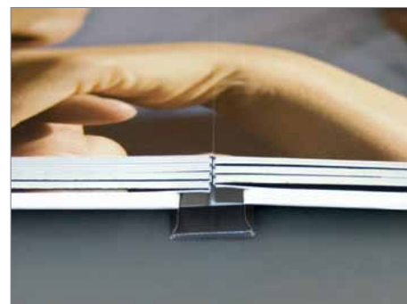
The finished book opens astonishing 180 degrees.