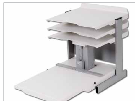
Fastbind FotoMount F46e is a compact, tabletop unit.

Cover Guide, Supply Shelf and two Cover Positioning Holders included. Fastbind Mountinglift™ system: patents pending. Product information as of February 2009 and is subject to change without notice.