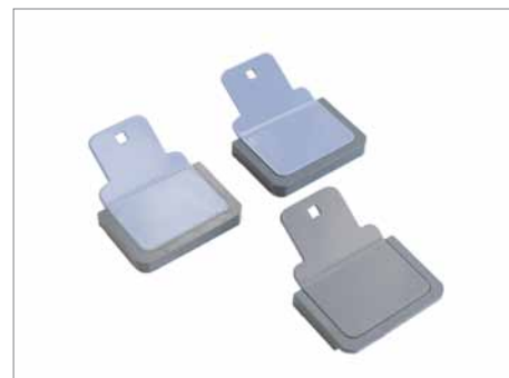
A Cover Guide and two Cover Positioning Holders are included.