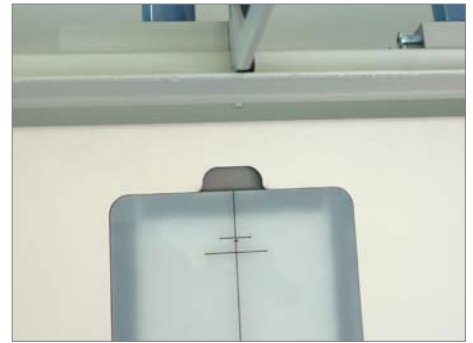
Registration marks for thicker and thinner materials offer you more versatility in applications.